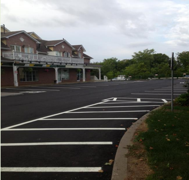
LOCATION: 10442 ISLINGTON AVE., KLEINBURG

Durable Surfaces. Lasting Impressions. Recently completed projects.