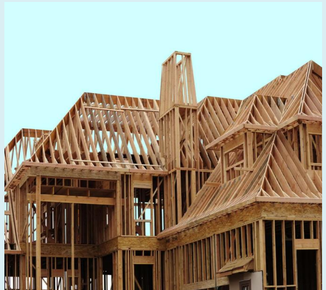
LOCATION: 7590 OLDE TREMAINE RD, MILTON