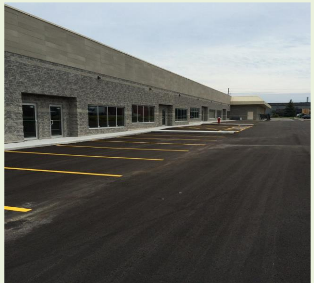
LOCATION: 6809 INVADER CRESCENT, MISSISSAUGA