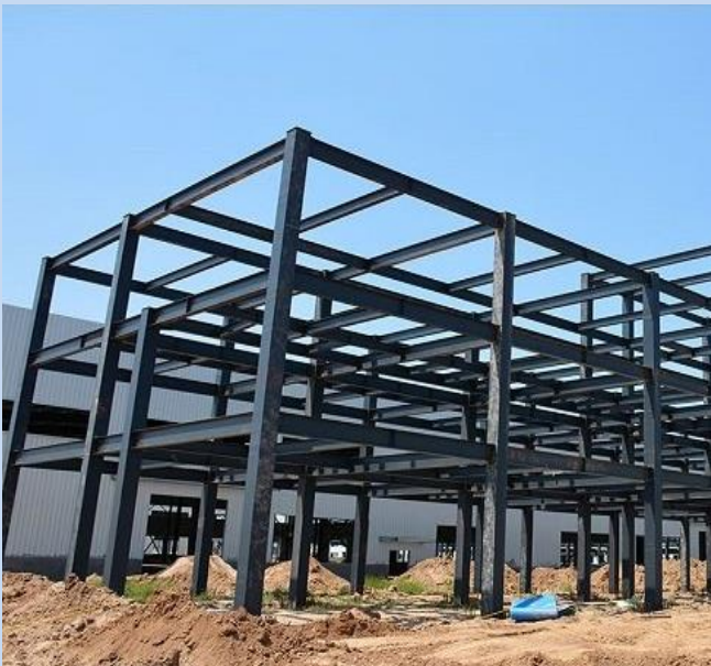
LOCATION: 200 MONTCLAIR RD, WOODSTOCK