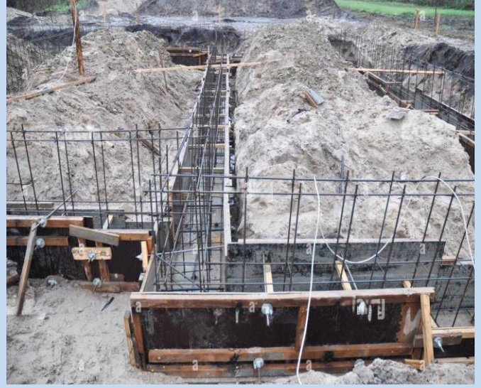
LOCATION: 1515 MAIN STREET E, MILTON