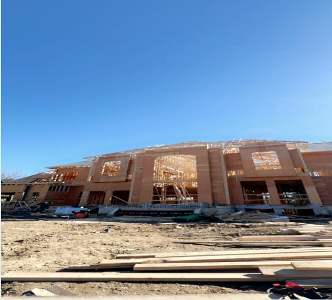
LOCATION: 8529 CASTLEDERG SIDE RD, CALEDON

Precision Shell Construction Recently completed projects: