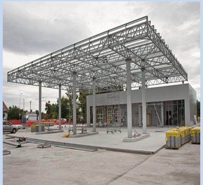
LOCATION: 110 TALBOT STREET W, AYLMER