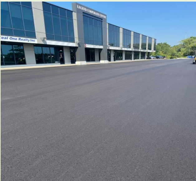
LOCATION: 1660 NORTH SERVICE, OAKVILLE