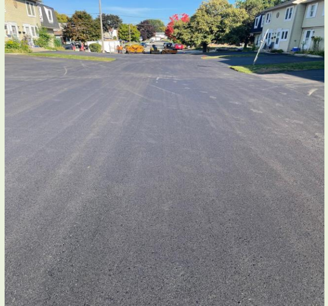
LOCATION: 99 HEIMAN STREET, KITCHENER