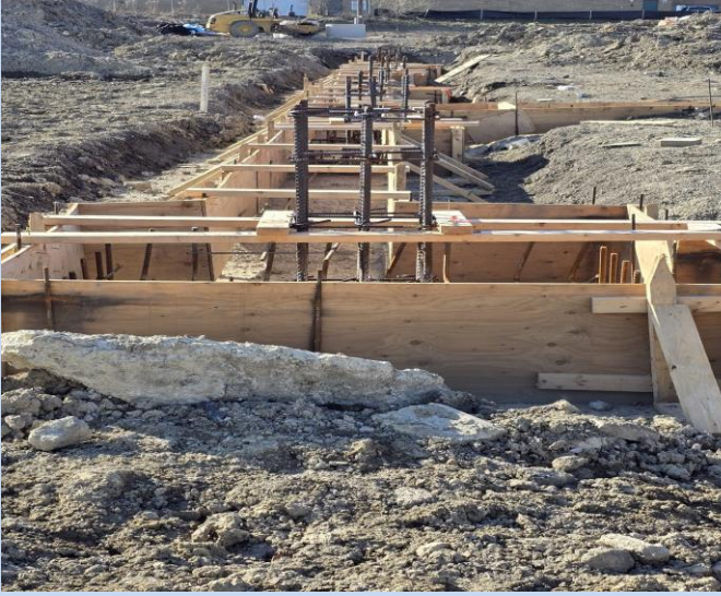
LOCATION: 521 BAYFIELD RD., BERRIE