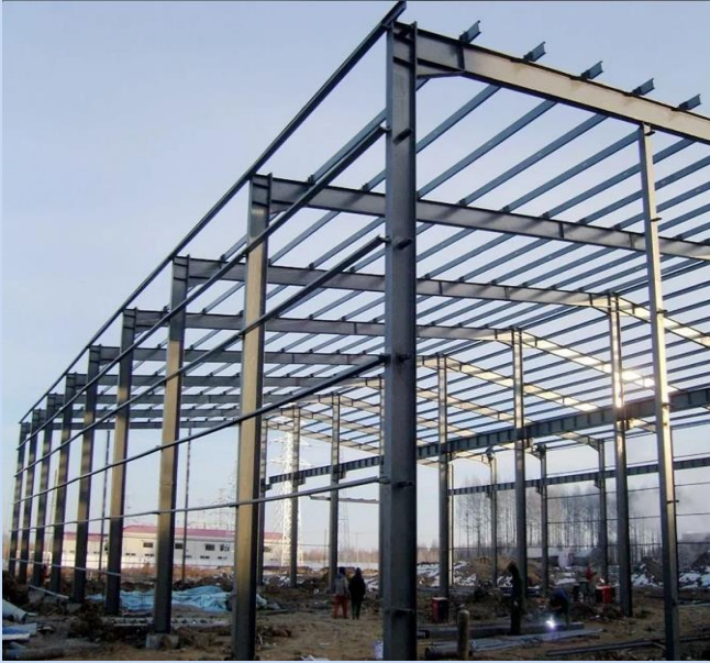
LOCATION: 2140 KAINS RD, LONDON

The Strength Behind the Structure Recently completed projects: