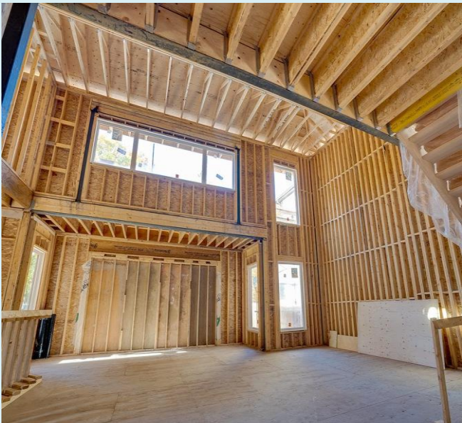
LOCATION: 16162 HIGHWAY 50 RD, BOLTON