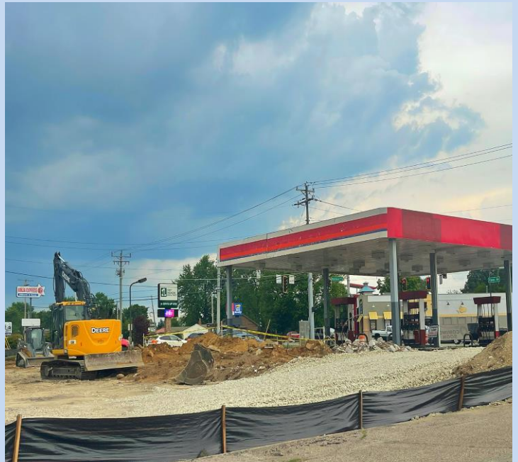
LOCATION: MACTON ESSO GAS STATION