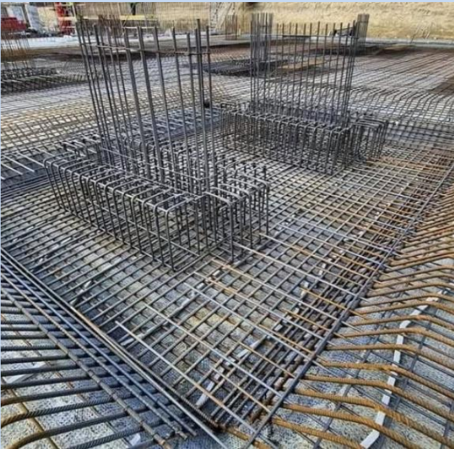
LOCATION: 12476 HIGHWAY 50, CALEDON