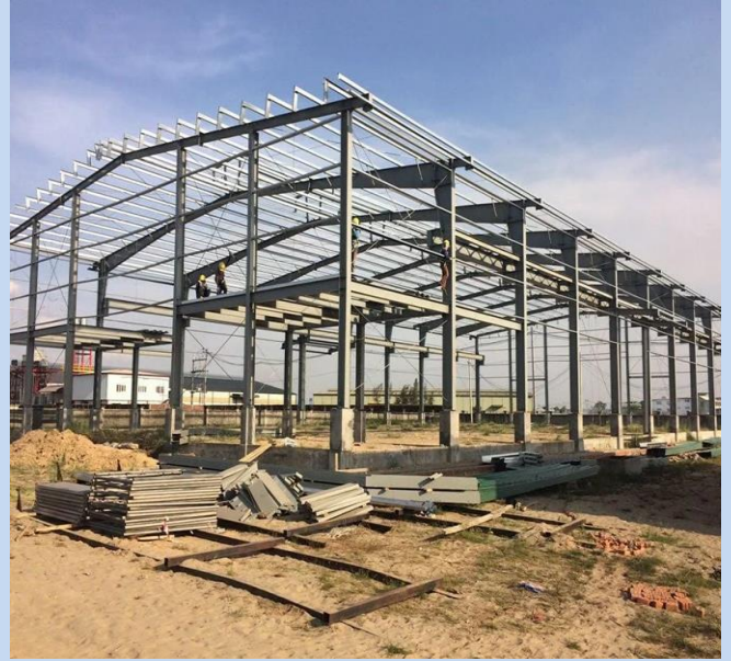
LOCATION: 633 GREEN HILL AVENUE, OSHAWA