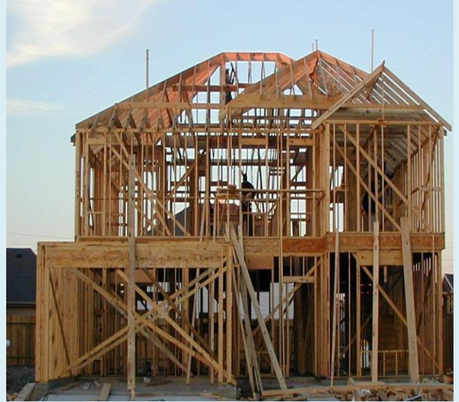
LOCATION: 6842 SECOND LINE WEST, MISSISSAUGA